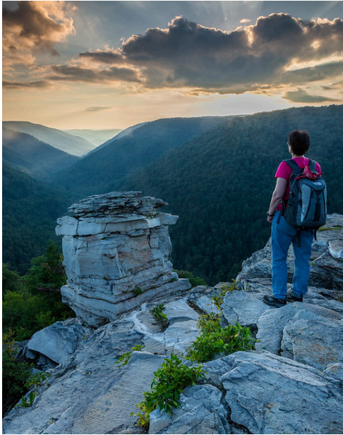
A hiker at Lindy Point watches the sunset over Blackwater Canyon.