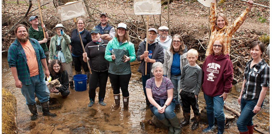
Citizen scientists during a WVDEP/WV Rivers joint Save Our Streams Workshop. Documenting stream life populations is an important component of our monitoring program.

In 2012, WV Rivers was approached by Trout Unlimited to develop a volunteer water quality monitoring program in West Virginia designed to safeguard coldwater streams from shale gas development.