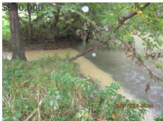
Muddy water from MVP construction pollutes Indian Creek in Monroe County, WV.

In 2021, MVP was hit again with 29 violations for their failure to protect water resources.