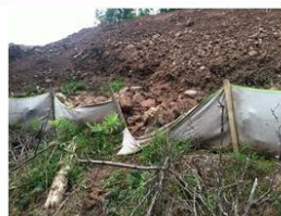
Failed Erosion Control