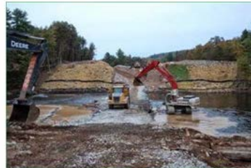
Equipment in Stream