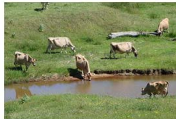
Livestock in Stream