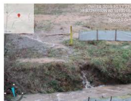
Sediment Laden Water Entering Stream