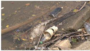
Litter in Stream