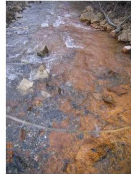
Acid Mine Drainage