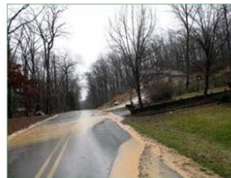
Sediment on Roadway