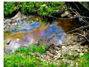
Petroleum Spill and/or Fish Kill

The West Virginia Stream Watch app is a smartphone-enabled form designed to document and share water quality and habitat issues on West Virginia streams and rivers.