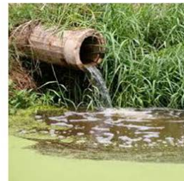
Pipe Discharging into Stream