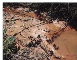
Sediment in Stream/Wetland