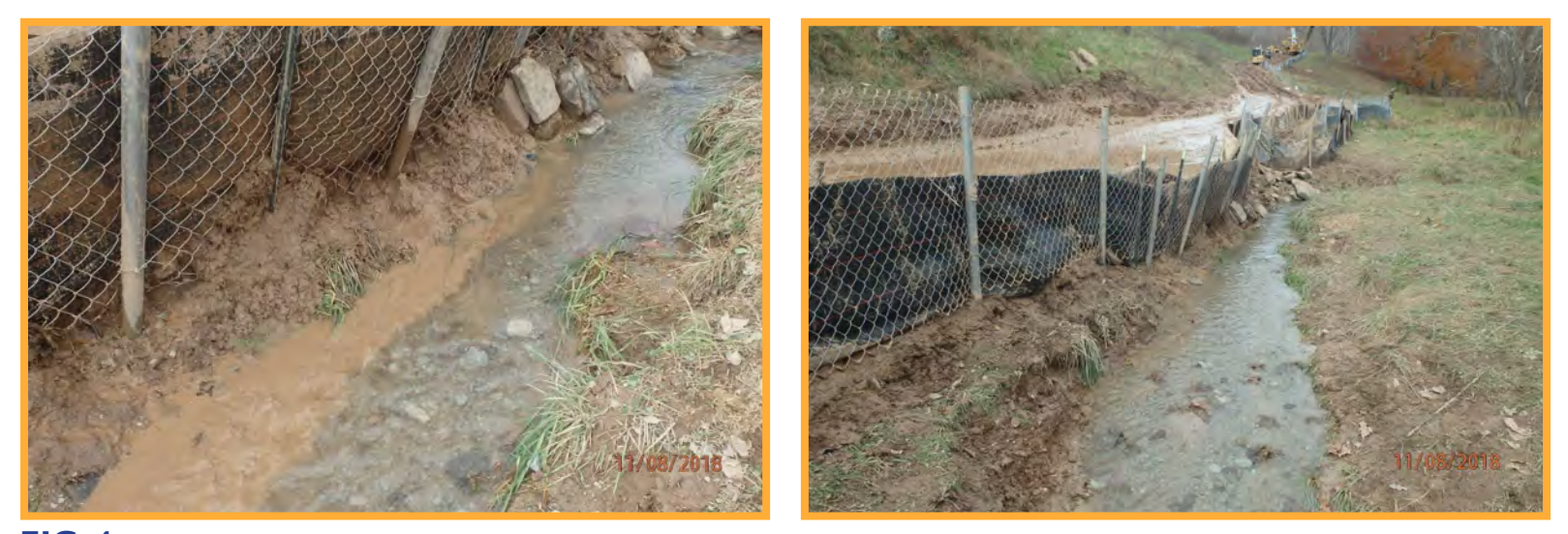
FIG. 4 In this tributary to Georgescamp Run, distinctly visible settleable solids and deposits are considered "conditions not allowable" in the WV permit for the project. WVDEP issued a violation to the Mountaineer Xpress Pipeline for this incident.

There are a variety of erosion control techniques, such as silt fence, super silt fence, compost filter socks, slope drains, and slope breakers with sumps and terminus treatments, all designed to keep sediment within the worksite and out of streams and rivers. Practices for implementation of these methods are detailed in state guidance documents such as the Virginia Erosion and Sediment Control Handbook and the West Virginia Erosion and Sediment Control Field Manual. In some cases, where steep slopes and highly erodible terrain increase erosion potential, these BMPs have been proven to be ineffective. In addition, even when proper BMPs for site conditions are used, BMPs fail due to improper installation or a lack of maintenance.