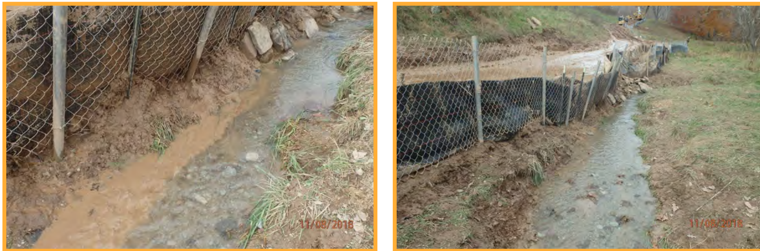
FIG. 4 In this tributary to Georgescamp Run, distinctly visible settleable solids and deposits are considered “conditions not allowable” in the WV permit for the project. WVDEP issued a violation to the Mountaineer Xpress Pipeline for this incident.

There are a variety of erosion control techniques, such as silt fence, super silt fence, compost filter socks, slope drains, and slope breakers with sumps and terminus treatments, all designed to keep sediment within the worksite and out of streams and rivers. Practices for implementation of these methods are detailed in state guidance documents such as the Virginia Erosion and Sediment Control Handbook and the West Virginia Erosion and Sediment Control Field Manual. In some cases, where steep slopes and highly erodible terrain increase erosion potential, these BMPs have been proven to be ineffective. In addition, even when proper BMPs for site conditions are used, BMPs fail due to improper installation or a lack of maintenance.