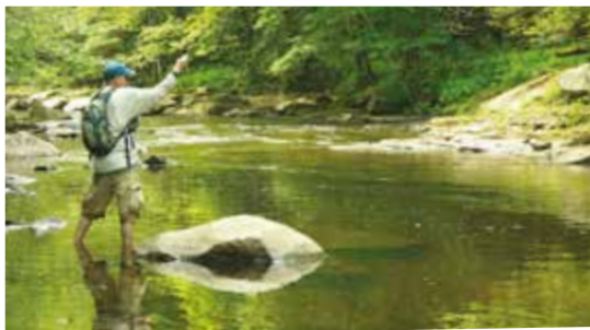
Access for fishing, hunting, paddling and other outdoor recreation would be protected through Birthplace of Rivers National Monument.

Visit the proposed monument area this summer. Bring your bike and ride the forest roads; find yourself captivated by Cranberry Glades; take a nap listening to birdsong; snap selfies at the Falls of Hills Creek. You'll get it. You'll see why our headwaters deserve permanent protection.