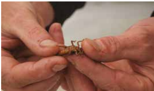
Viable populations of macroinvertebrates are a key indicator of stream health.

We need to get baseline water quality data for each stream in preparation for potential construction impacts. Watch for a volunteer training schedule coming soon.