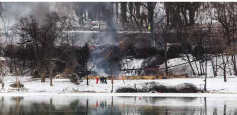
The train derailment and fires at Mount Carbon, WV, along the Kanawha River.

WV Rivers teamed up with Kentucky Waterways Alliance on a campaign to reduce mercury discharges into the Ohio River. Mercury poisoning causes brain damage in children and kidney failure in adults. The campaign, "NO MORE (No Mercury in the Ohio River Environment)" rejects a proposal to further delay or abandon a river-wide ban on mercury dilution zones. The Ohio River Valley Water Sanitation Commission (ORSANCO), which sets water pollution limits for the river, ordered the ban 12 years ago on concentrated industrial discharge zones where mercury could be diluted, but never removed. Now industry wants exceptions. Over 250 WV Rivers supporters signed a petition and submitted comments urging ORSANCO to stand by its October 15 deadline for companies to comply.