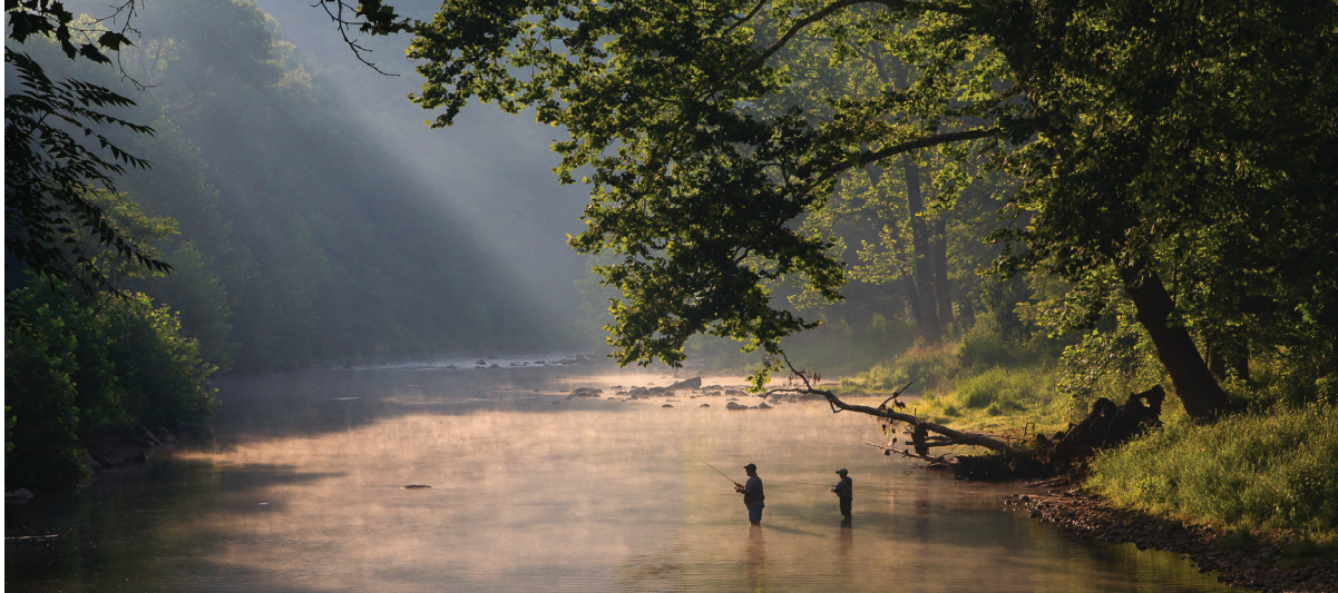
South Branch of the Potomac River, photo by Kent Mason.

The poll validates the work WV Rivers does to protect the nearly 15,000 miles of streams that supply surface water intakes for public drinking water systems. More than half of these stream miles, 8,387 miles of them, are small, often intermittent headwater streams. While it's almost impossible to keep an eye on an every mile, we can work for state and federal policies that ensure the water we drink and enjoy comes from pure, healthy headwaters.