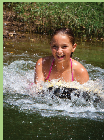
Elk River, photo by Keely Kernan.

Source water protection plans. Another revelation from the WV water crisis is that most of our public drinking water systems do not have plans in place to protect source water. The state completed assessments of threats to drinking water supplies, but for most the next step—plans to manage identified contamination threats—were not completed. Now all public water utilities supplied or influenced by surface water must involve the public in completing a source water protection plan.