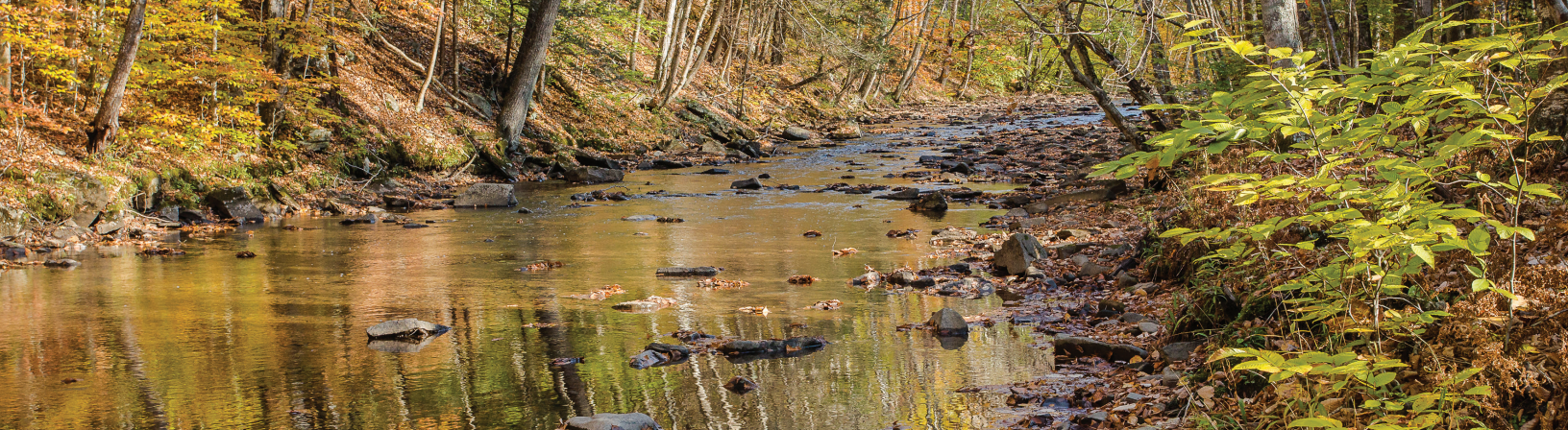
Greenbrier River